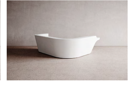
Configuration 9 W102.5/101.5 D34.5 H30/37.5/43.5"