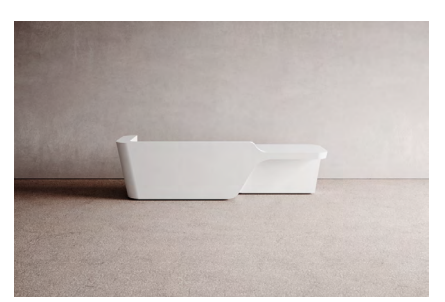
Configuration 4 W127 D34.5 H30/37.5/43.5"