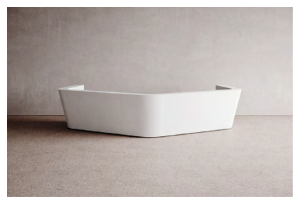
Configuration 7 W151/84.5 D34.5 H30/37.5/43.5"