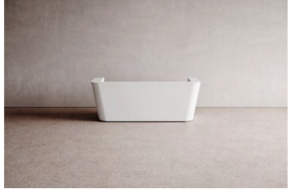
Configuration 2 W96.5 D34.5 H30/37.5/43.5"