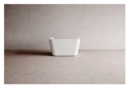
Configuration 1 W65 D34.5 H30/37.5/43.5"