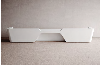
Configuration 5 W222.5 D34.5 H30/37.5/43.5"